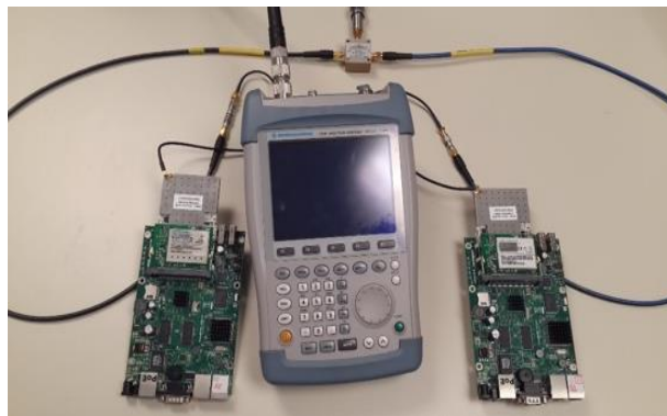
Figure 1: Cabled measurement setup using 60 dB of attenuation and a splitter to check performance of devices without interference and with various levels of attenuation