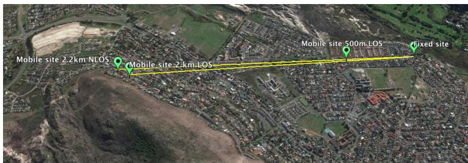
Figure 3: Location of outdoor test sites in Fish Hoek, Cape Town