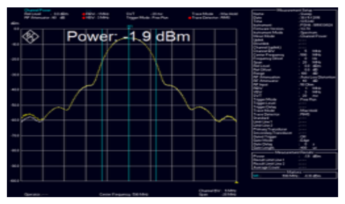
Figure 2: The measured power of the signal at channel 11 with power level set to 20 dBm.

compared with 100 kHz in Fig. 3). This shows the importance of setting a smaller RBW to see spurious emissions.