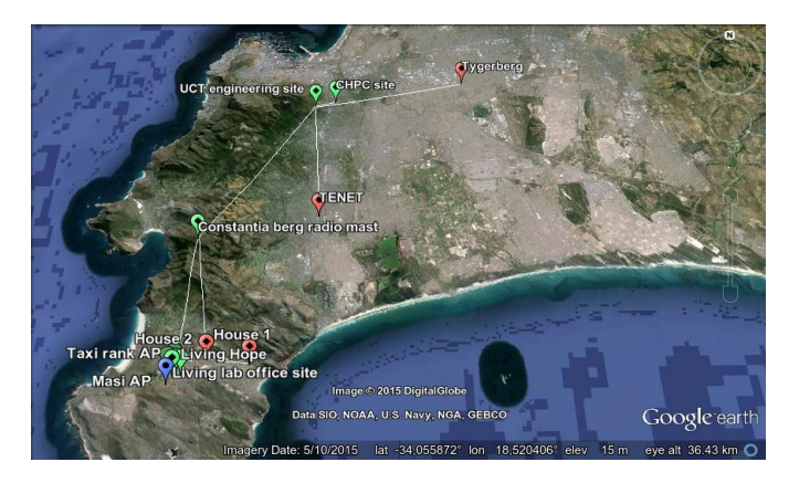
FIGURE 3: outdoor mesh node placement.